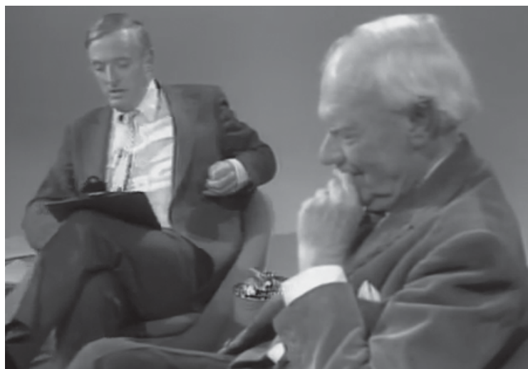
William F. Buckley Jr. and Malcolm Muggeridge on “Firing Line”

2015 will mark 25 years since Malcolm’s death and this quarter-century without him has been marked by a huge interest in his works, especially since the “Malcolm Rediscovered” event at Wheaton College in 2003. There will be a major series of activities next year on both sides of the “pond.”