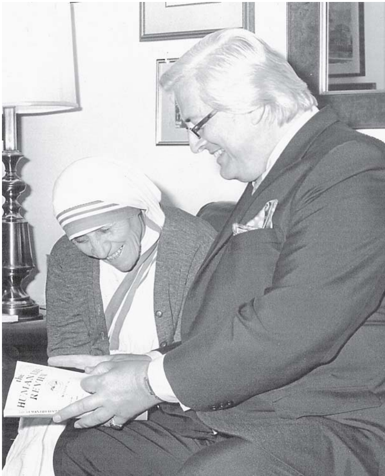
Mother Teresa and Henry Hyde peruse HLR in 1981.

Abortion is not a single issue. And the Lord will not permit it to continue indefinitely. The single issue is the welfare of our nation.