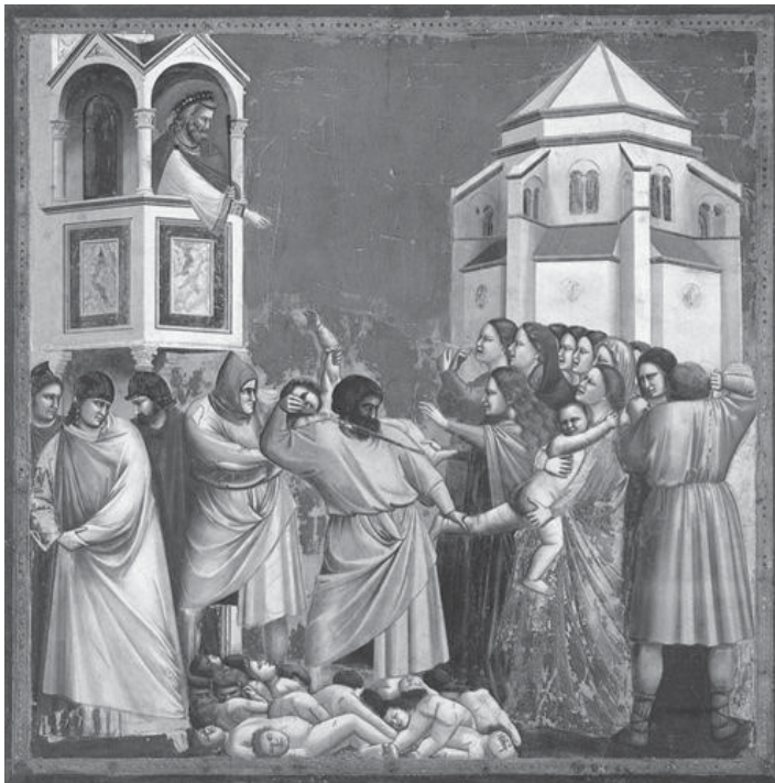
Giotto, “Slaughter of the Innocents”

My God and my Mercy, I am ashamed to pray to Thee for very shame of my evil conscience; give a fountain of tears to my eyes, and to my hands largess of alms and charity; give me a seemly faith, and hope, and abiding charity. Lord, Thou holdest no man in horror save the fool that denies Thee. Oh, my God, the Giver of My Redemption and Receiver of my soul, I have sinned and Thou hast suffered me!