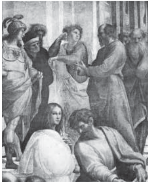
Socrates by Raphael

—To be continued in the next issue of the Human Life Review.